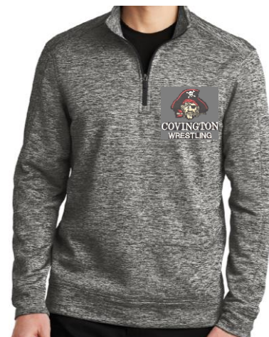
1/4 Zip Sweatshirt (C)