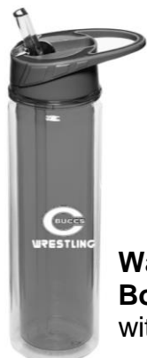
Water Bottle (G) with Logo

*may not be available for 2nd order date