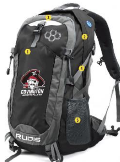
GearPack III Bag (J)

Embroidered Logo, Five storage compartments