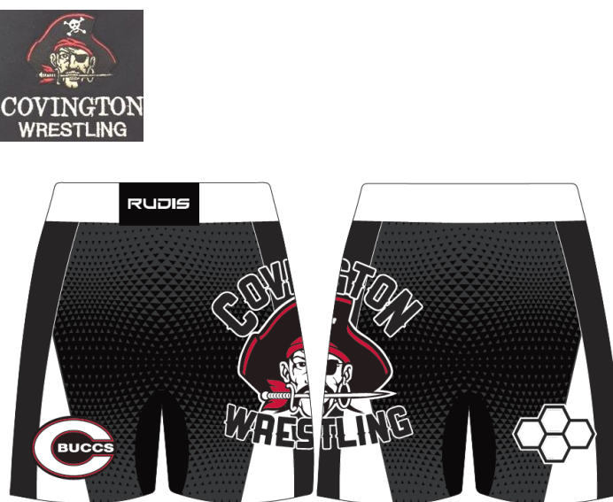
MMA Style Shorts (E)