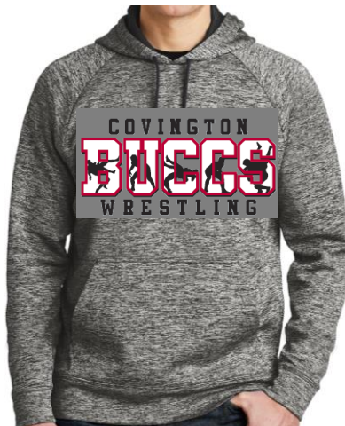
Hooded Sweatshirt (B)