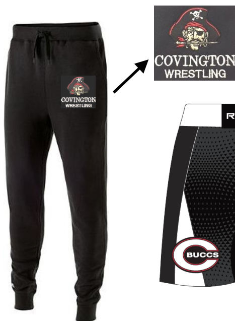
Jogger Sweat Pants (D)