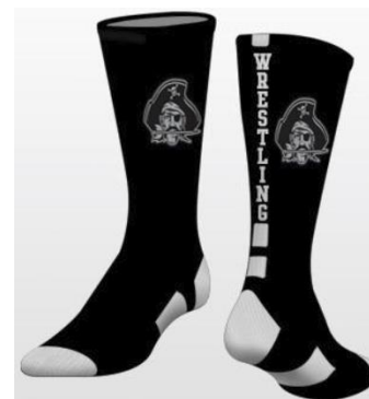
Hype Socks (F)

*may not be available for 2nd order date