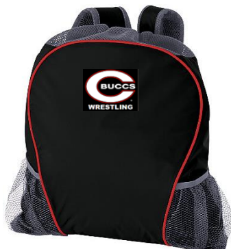
Cinch Bag (H)